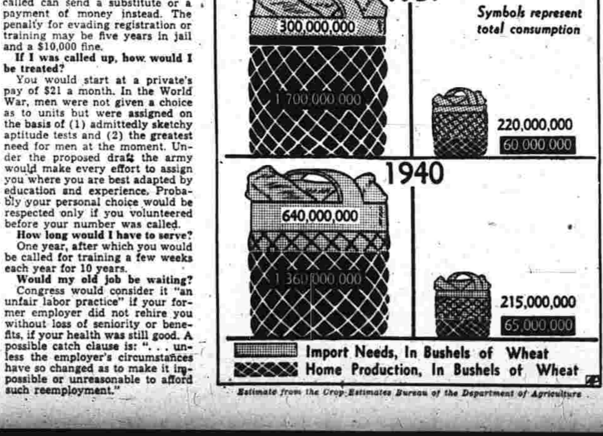
Import Needs, in Bushels of Wheat Home Production, in Bushels of Wheat

What's A Bow Without A Cord? Lead The Way, Bollow, Millions Will Follow